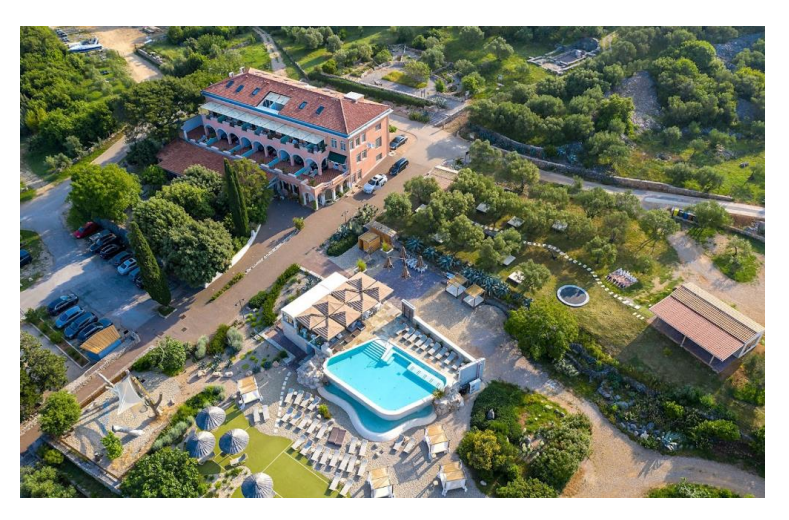
Distance from the Hotel to the "theory room" and boat parking is about 1 km.